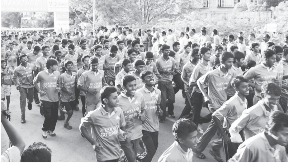
Participants at the Green Marathon organised by the Vickram College of Engineering in Madurai on Sunday