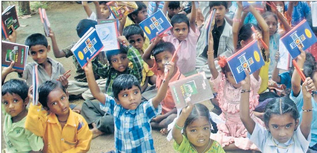
LOOK, BOOK: Rural children with their new notebooks